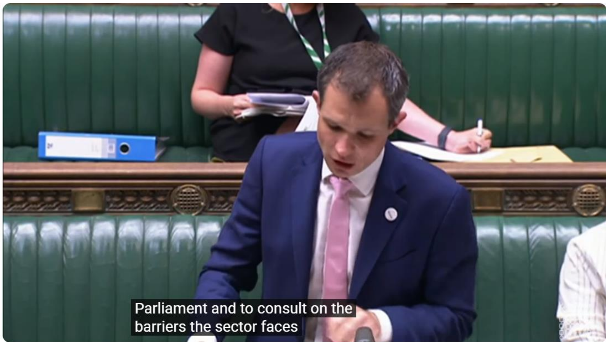
Energy Bill Report Stage in the House of Commons (highlights)